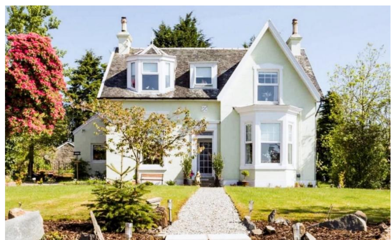
A corner of my studio in Kenyon Villa, Dunoon.